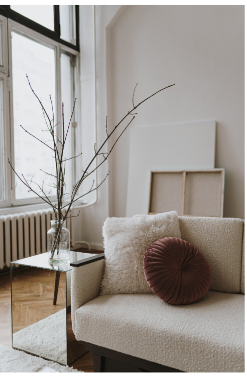
table or a locally made ceramic vase, mindful consumption encourages homeowners to choose items that bring joy and meaning to their lives, rather than succumbing to impulse purchases and fleeting trends.

Environmental Consciousness: Minimalism and mindful consumption go hand in hand with environmental consciousness, as both philosophies encourage homeowners to reduce consumption, minimize waste, and make sustainable choices. In 2024. homeowners are increasingly aware of the environmental impact of their purchasing decisions and are seeking out eco-friendly alternatives for their homes. Whether it's choosing sustainable materials, supporting ethical and transparent supply chains, or opting for energy-efficient appliances, minimalist design and mindful consumption offer homeowners a pathway to create homes that are not only beautiful and functional but also environmentally responsible.